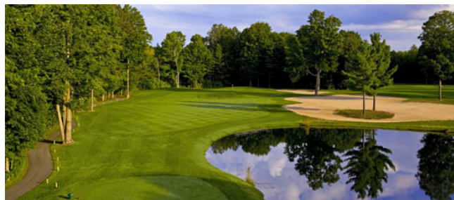
Mountain Ridge, Hole #12, 133 yard par 3

Despite a challenging layout the Mountain Ridge Course is very playable and provides for breathtaking views of the Betsie River Valley. The course carves through heavily forested highlands with expansive waste bunkers and tree-lined fairways.